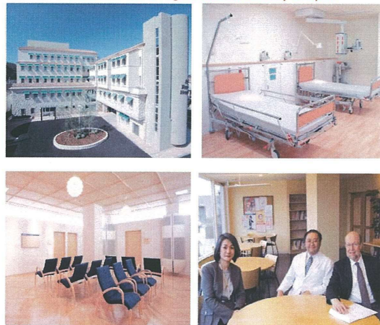
Ayabe Renaiss Hospital Pictures from Home Page of Sweden Embassy in Japan

Hospital Tour in Västerbotten. Norrbotten: Hospital in Umeå Univ. Sunderby