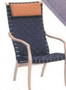
albin i Hysna