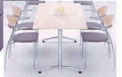
EFG in Sweden